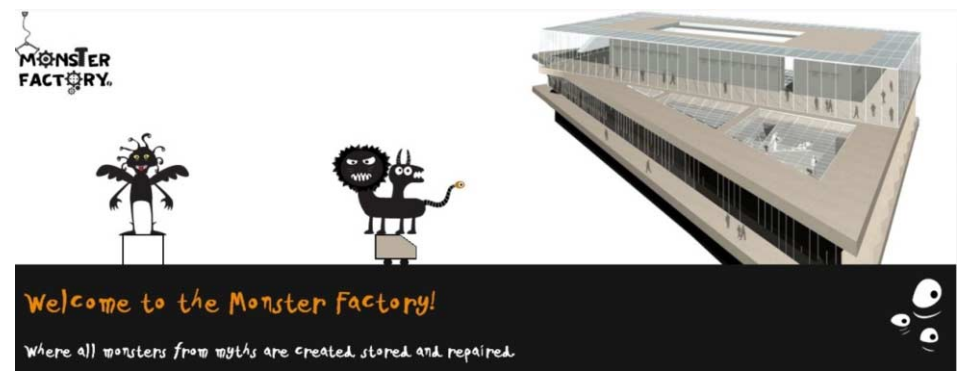
Figure 2. The Monster Factory Game

Stories are commonly considered to have a narrative form, containing a set of smaller story pieces which are typically placed into a static order by the author, so as to communicate one or more messages to the end user/audience. Depending on the type of the story (and the author's will), the ordering of the smaller story pieces may be strict, allowing for no other orderings, or flexible, enabling the production of alternative orderings of the same story pieces, which all convey the same message(s).