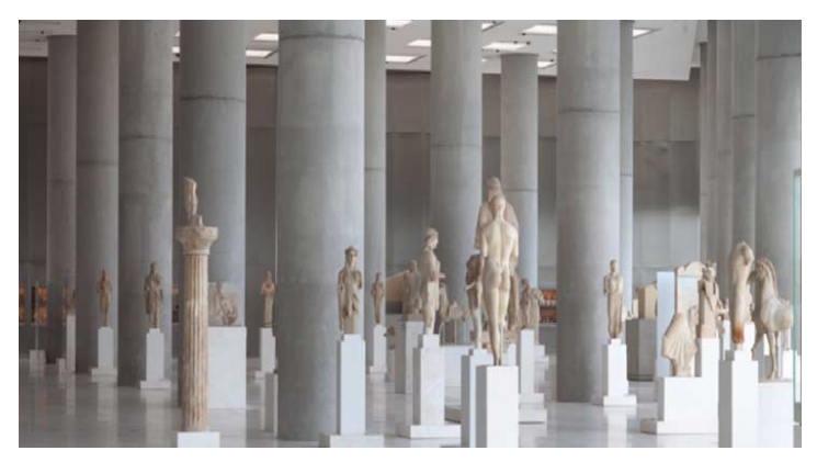
Figure 1. The Archaic Gallery

At the Acropolis Museum, the CHESS project focuses on the Archaic Gallery (figure 1), which is located on the first floor. Here, visitors can wander amongst the architectural and sculptural remains of the period spanning from the 7<sup>th</sup> century B.C. to the Persian Wars (480/79 BC). The flexibility of its design, as well as the diversity of historical facts and approaches behind the objects, makes the Archaic Gallery the perfect context to develop the CHESS project.